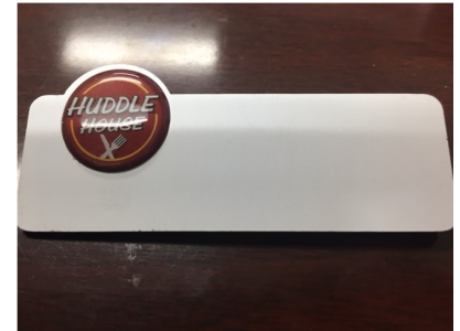
Team Member Badges

Manager badges will be name engraved and have a magnetic clap back. Manager name badges are ordered through Icebox.